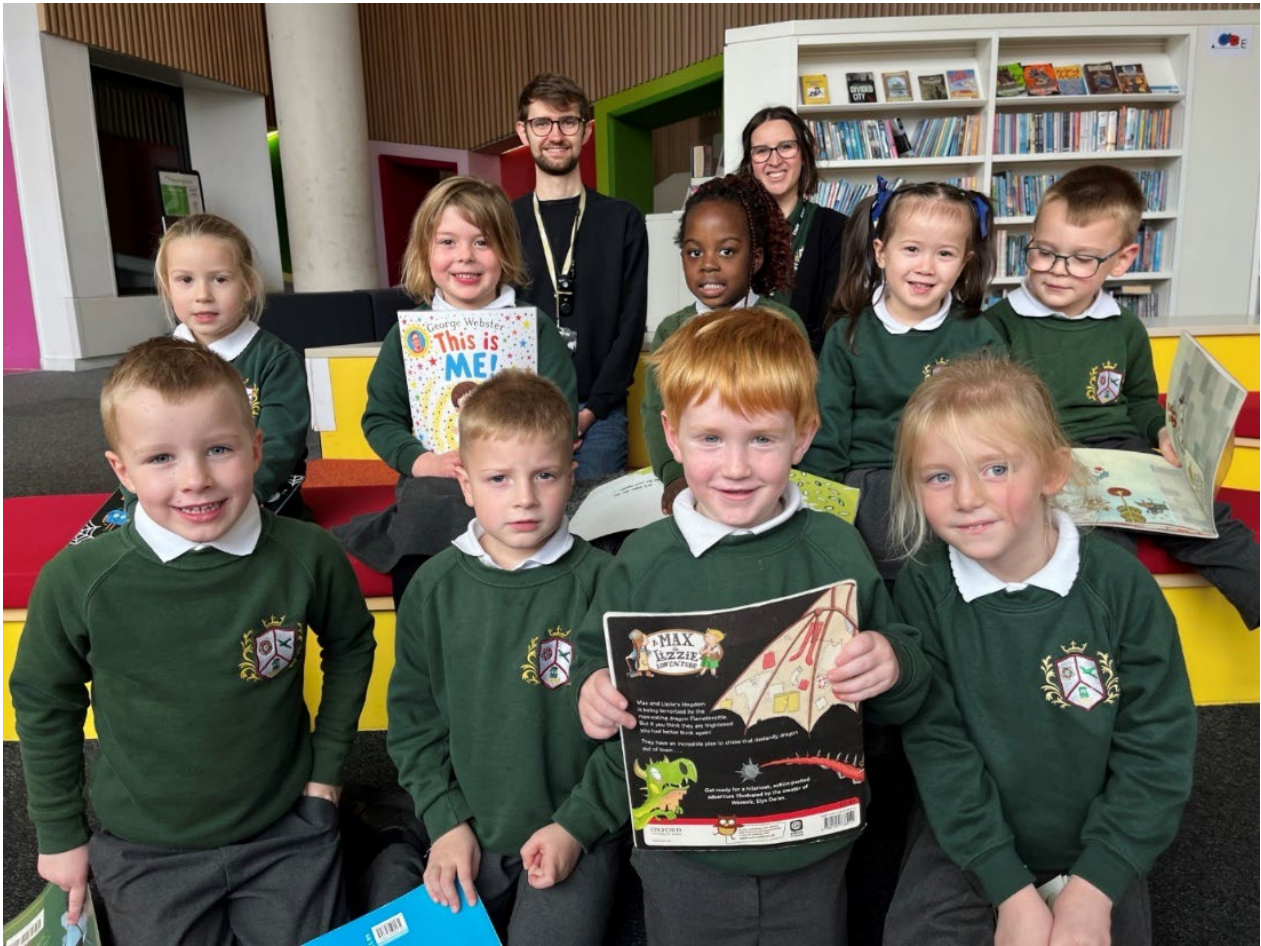
Children from Tudor Grange Primary Academy Perdiswell enjoying their visit to The Hive